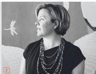
Alison Pickart for Sculptech

product Sapling standout The 5-foot-tall table lamp's hammered-bronze stem terminates in a canopy of white carbon-fiber petals lit by color-changing LEDs that can be programmed to respond to sound and movement. Through Alison Pickart. alisonpickart.com