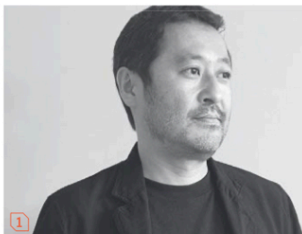
Ichiro Iwasaki for Vibia

product Pin standout Punctuating a lean steel line, an aluminum dome in minimalist matte black or cream rotates to shed LED light where desired. Combine them into multiprong sconces to make abstract wall art. vibia.com