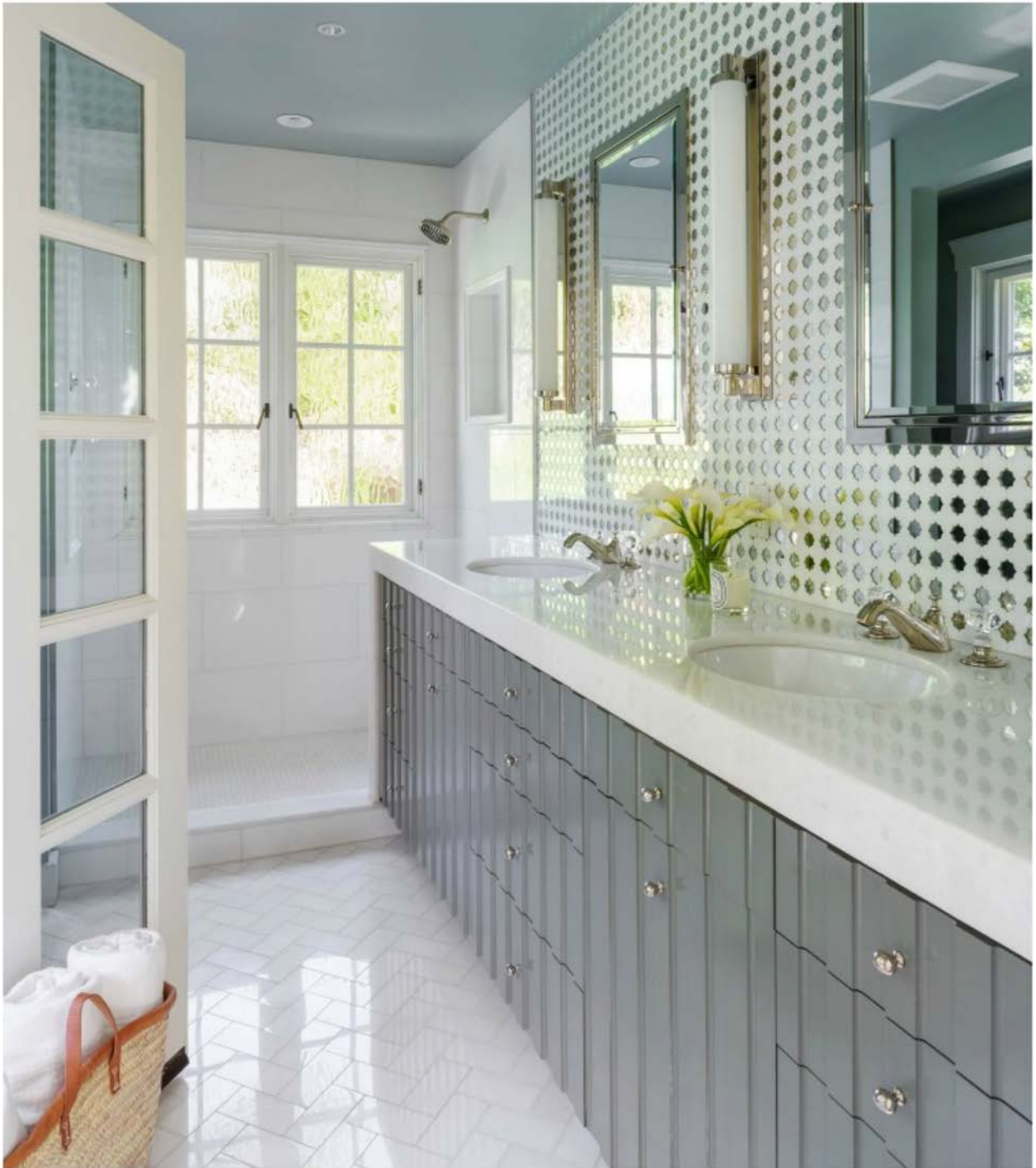
This light and bright bathroom combines the best of the best of the classics and the brand new for a totally unique look.