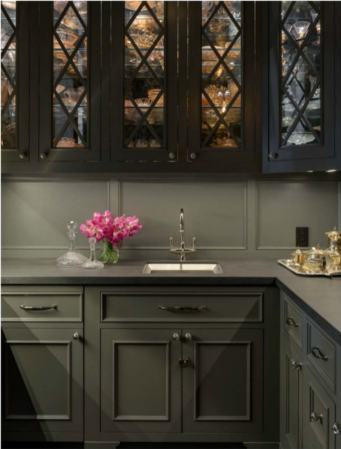
The crystal and silver is all in its place—in a butler’s pantry whose color is very now. That’s that perfect blend that Pickart makes look so easy.